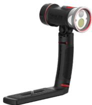
Sea Dragon 3000SF Pro Dual Beam (SL679)