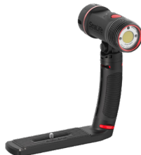
Sea Dragon 3000F Auto Light (SL678)