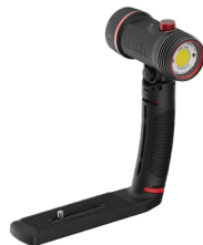
Sea Dragon 3000F Color Boost (SL681)

Sea Dragon Lights shown with Grip and Tray, light heads are also available separately without Grip and Tray.