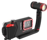
SportDiver Ultra Pro 2500 w/ light