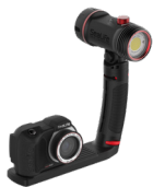
Micro 3.0 Pro 3000 w/ light

Get brighter, more colorful results by expanding your underwater camera system. The modular Flex-Connect® arms, grips and trays easily fit together to create popular configurations. The following camera sets are available complete, including camera and lighting.