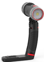
Sea Dragon 2000F Light (SL677)