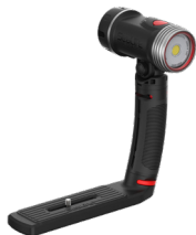
Sea Dragon 2300F (SL682)

Sea Dragon Lights shown with Grip and Tray, light heads are also available separately without Grip and Tray.