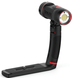
Sea Dragon 3000F Auto Light (SL678) with Flex-Connect® Grip (SL9905) and Single Tray (SL9903)