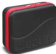
Sea Dragon Case (SL942) (Case NOT included with 2000F light)