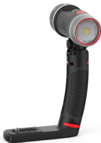
Sea Dragon 2000F Light (SL677) with Flex-Connect® Grip (SL9905) and Micro Tray (SL9902)