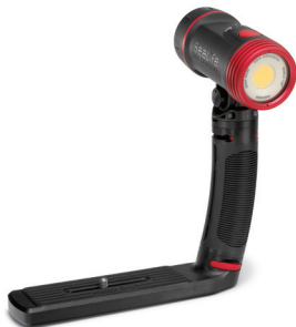
Sea Dragon 2500F Light (SL671) with Flex-Connect® Grip (SL9905) and Single Tray (SL9903)