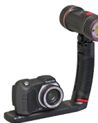
Micro 3.0 Pro 3000 w/ light

Get brighter, more colorful results by expanding your underwater camera system. The modular Flex-Connect® arms, grips and trays easily fit together to create popular configurations. The following camera sets are available complete, including camera and lighting.