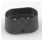
Charging Tray (SL98311)