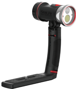
Sea Dragon 3000SF Pro Dual Beam Light (SL679) with Flex-Connect® Grip (SL9905) and Single Tray (SL9903)