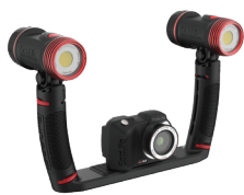
Micro 3.0 Pro 5000 w/ 2 lights