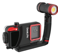
SportDiver Pro 2500 w/ light