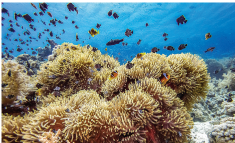
Shooting up and adding a layer of blue water adds contrast.

Try and shoot upwards from below the subject so you get a blue water background and better contrast. Get the entire subject into your picture frame. Don't cut off the hands, fins or head of your subject. You can always crop your image later on your computer if you want.