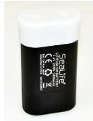
Li-ion Battery (SL9831) w/protective cover