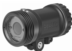
Sea Dragon 5000+ light head with YS adapter