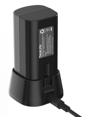
50W Li-ion battery with protective cover, charging tray and AC power adapter