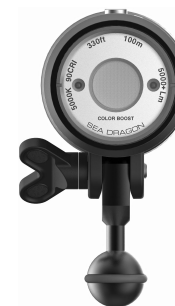
1" Ball Joint