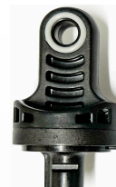
Flex-Connect YS adapter